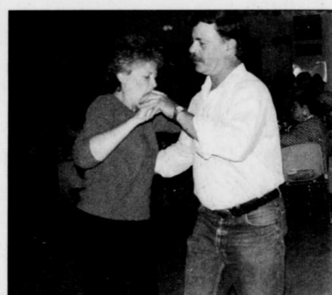
A couple dances away during the Old Time Dance last Saturday at the Lions Hall in Shawville. The dance raised money for the annual Cancer Relay for Life Walk.

"A lot of the people here follow The Brysonaires and go wherever they perform," she said. "There were a lot of weddings in town but we are happy a lot of people still came through."