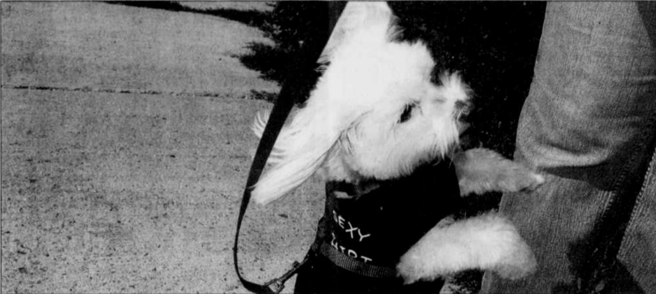
Gwai Gwai, un petit Maltese d'un an est fier de participer au Marcheton Wiggle Waggle qui a eu lieu à Campbell's Bay dimanche matin.