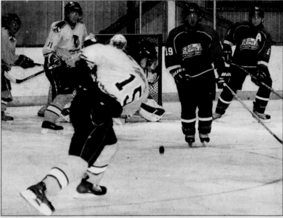
Wilbur McLean, The Equity

"They're two young kids but they're both very good,"