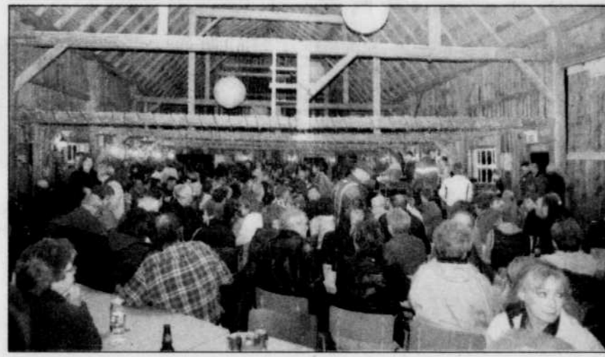
A jaw-dropping number of people turned out to the Northfork Country Kitchen barn dance, held Saturday in Nichabeau as a fundraiser for the family that lost their home in the fire that burned down Fred's Hotel in Chapeau.

The $7,285 raised Saturday night should go a long way to helping them. Performers on the evening included