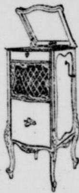
This illustration shows a new 110c Maschine with diamond point, which also plays Needle Records.