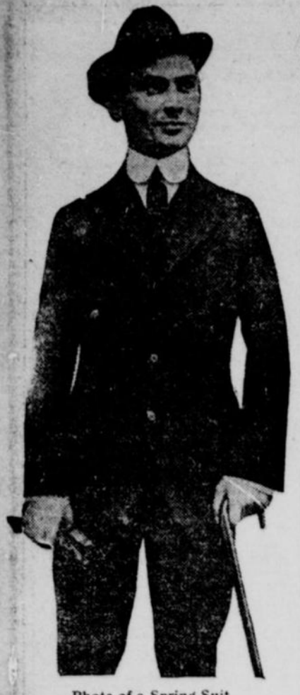
Photo of a Spring Suit AS WORN BY HIM Good Clothes Cost Less To-day Than Twenty Years Ago

"The purchasing power of a dollar is just about half what it was twenty years ago," said a prominent industrial director, "but I bought yesterday in a Semi-ready store for $25 a grey worsted pick-and-pick weave which is exact in texture and wool quality to what I paid a custom tailor $35 for in 1895. I know, for I have both suits to-day for face to face comparison."