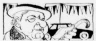
—to the lure of ads for marvelous cars for "spring."

February is the month when the sap begins to rise