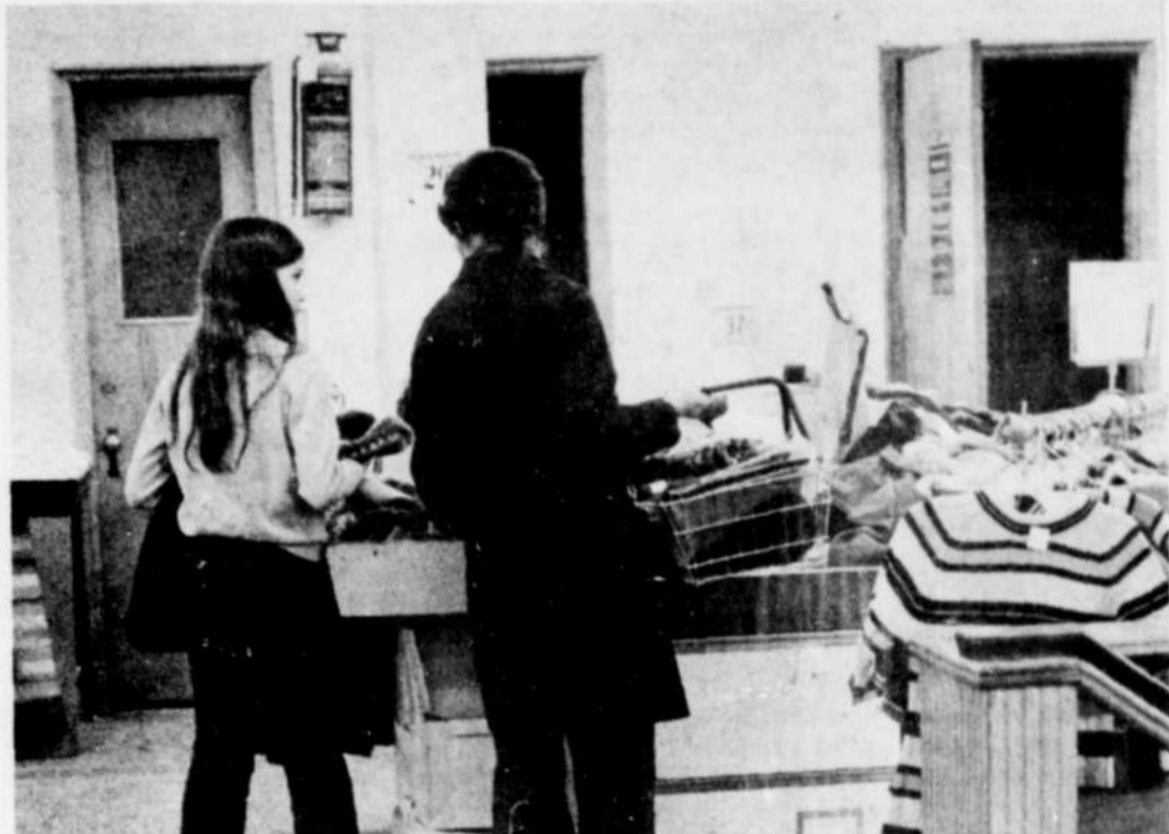
KIWANIS CAPER — A young and fortunate beneficiary chose a hat for herself at Au Bon Marche last night. She was taking part in the Sherbrooke Kiwanis a annual project to clothe the children of 45 families. The families are chosen on the suggestion of various social agencies.