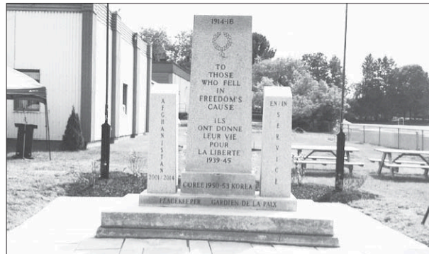
Many came to participate in the celebration parade for the 75th Anniversary of the Cowansville Legion, branch no. 99. The cenotaph has had two extra columns added, one for Afghanistan and one for active service