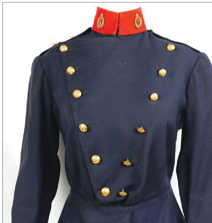
A nurse's uniform from the First World War. Nurses who served during the First World War were among the first women in Canada to receive the right to vote in federal elections.