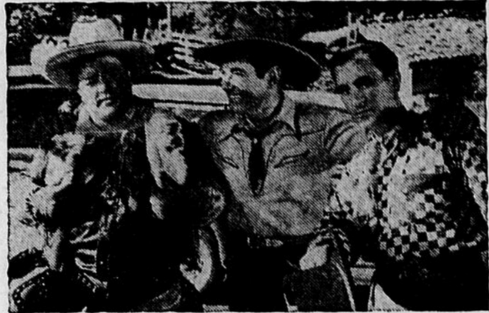
Bud Abbott, Johnny Mack Brown and Lou Costello in a scene from the film, "Ride 'Em Cowboy," which opens Sunday at the Monkland United Theatre and playing until Tuesday night.