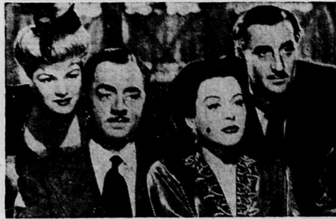
Claire Trevor, William Powell, Hedy Lamarr and Basil Rathbone in a scene from the stirring romantic drama, "Crossroads," opening Saturday at the York United Theatre and playing until Tuesday night.