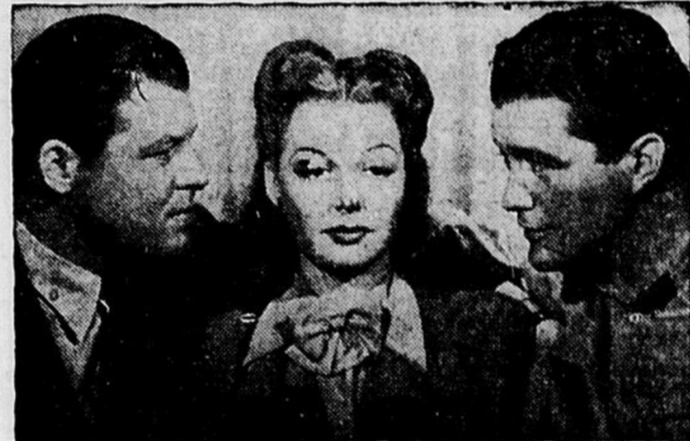
Three's A Crowd. But definitely so whenever Jack Carson and Ann Sheridan happen to meet Ann Sheridan at the same time, in Warner Bros. "Wings For The Eagle," which opens Sunday at the Westmount United Theatre and playing until Tuesday night.