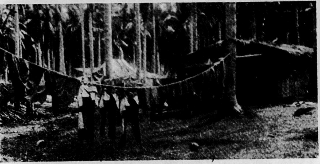
Caught short when the Marines arrived on Guadalcanal Island, the Jap naval officers in charge of this work camp left their washing on the line and their food on the table, and headed for the hills.