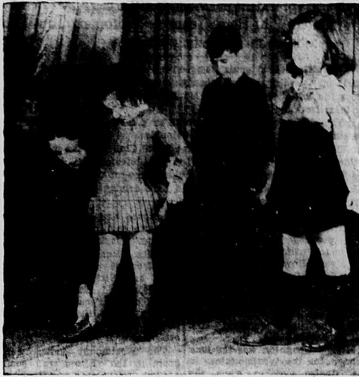
One of the many phases of instruction and correction at the Children's Theatre.