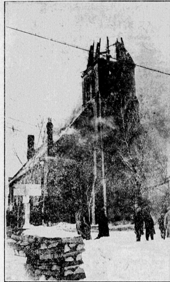
Photographed at 4.05 p.m. by R. K. Black.