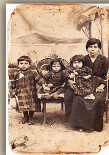
Survivor of the Armenian genocide, Liebanon, 1923

This spring, the MHMC will inaugurate an exhibition which invites you to learn, question and reflect on genocide from the perspective of its prevention. Over the years, it will deepen certain aspects of this topic. The first theme explored by the exhibit will be the transmission of the memory. Why do survivors speak? What issues do they raise? How?