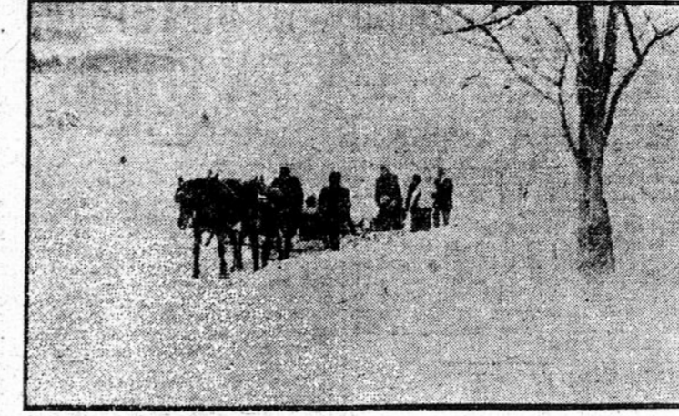
BRINGING THE SLEDS UP THE HILL.