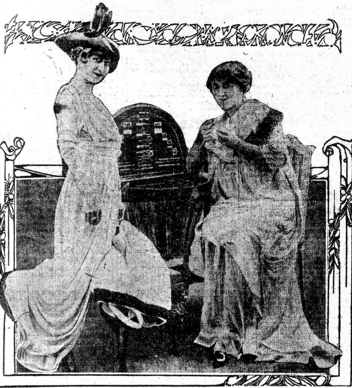
These two simple models are becoming very comfortable for indoor wear. The frock shown above con-

THE 'WITNESS' FASHION HINT: CHARMING INDOOR FROCKS.