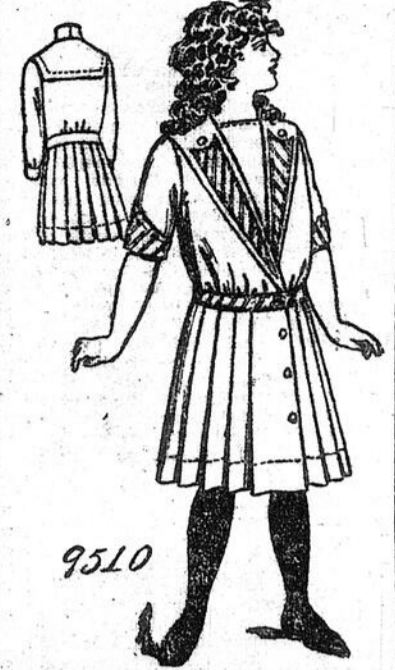
9510. A BECOMING FROCK FOR THE GROWING GIRL.

The home dressmaker should keep a little catalogue scrap book of the daily pattern cuts. These will be found very useful to refer to from time to time.