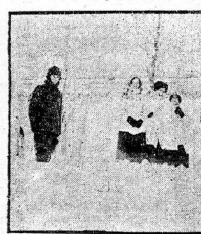
WAITING FOR THE SLEIGHS.