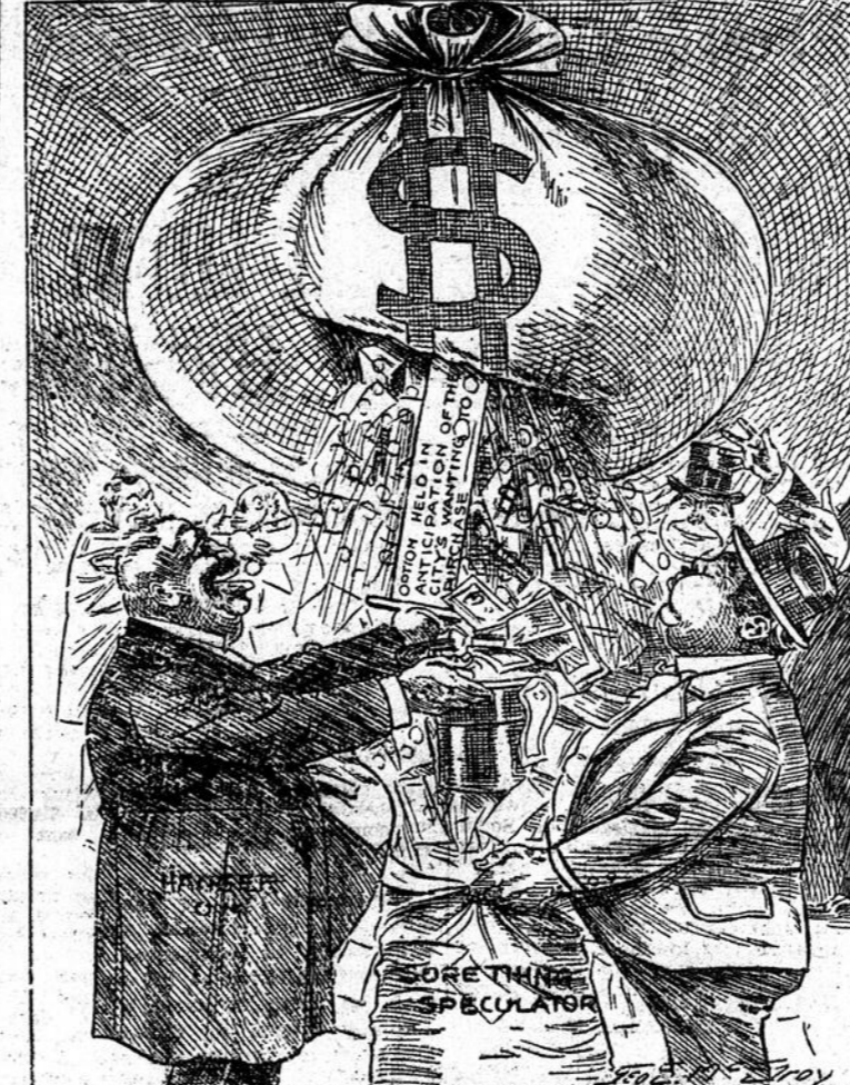
It is admitted at the City Hall that civic employees have made some profits by buying up property marked for expropriation by the city.