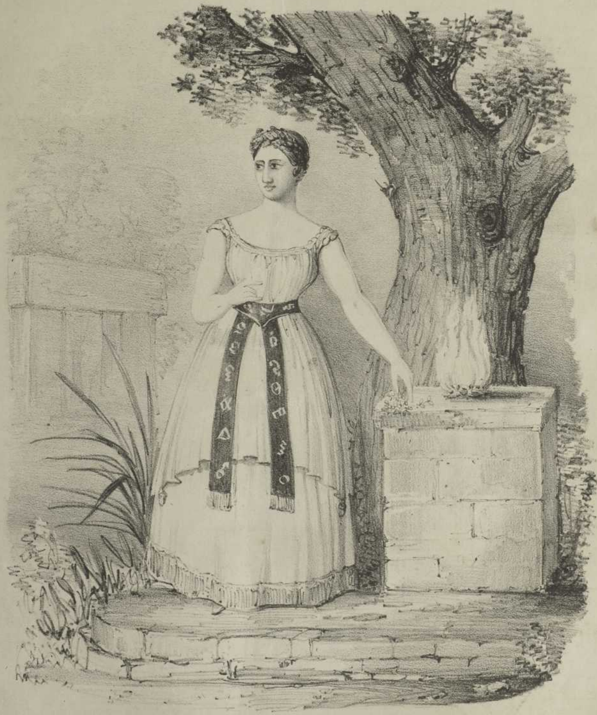
Miss Adelaide Kemble as Norma, gathering the Mistletoe. - Act. 1 Scene 1.