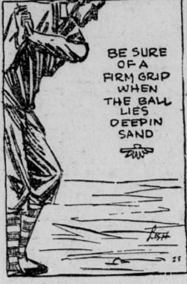
BE SURE OF A FIRM GRIP WHEN THE BALL LIES DEEP IN SAND

Should the grip on the club tighten when the golfer is playing from a bunker?