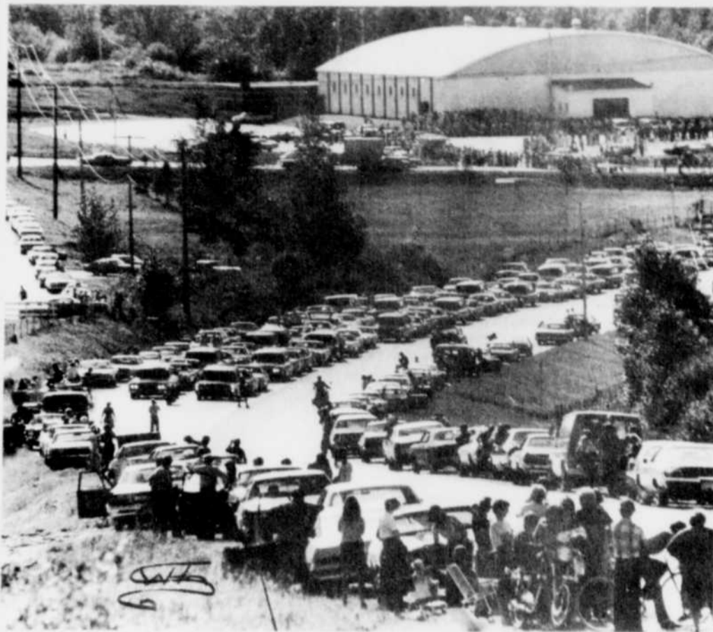
Thousands jammed the Asbestos Civic Centre last August for the funerals of the victims of the Eastman bus plunge.