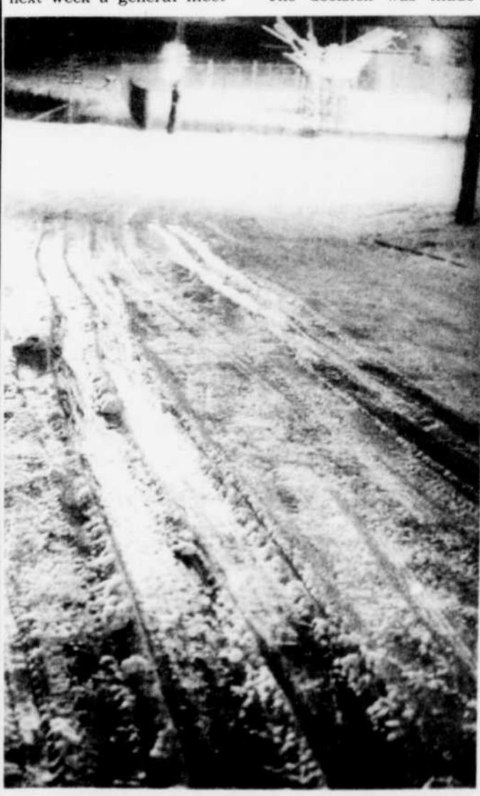
A repetition of last week's ice-coated streets is unlikely, at least until next week.

The decision was made under pressure from the provincial Ministry of Labour over the matter of provision of essential services in the event of a full-scale walkout.