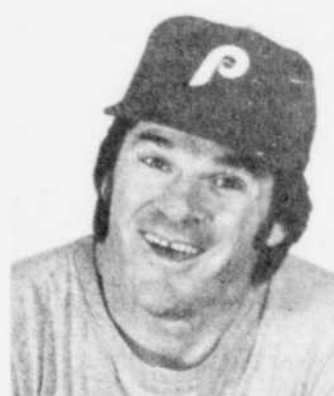
PETE ROSE ...a Phillie?

ORLANDO, Fla. (AP) — The annual baseball meetings turned into a wild guessing game Monday as speculation rose over what club finally would get free agent Pete Rose, reported to be carrying a gaudy $1 million-a-year price tag. At the end of the hectic on-again, off-again day, all five teams — Pittsburgh Pirates, Atlanta Braves, St. Louis Cardinals, Philadelphia Phillies and Kansas City Royals — said they were out of the bidding.