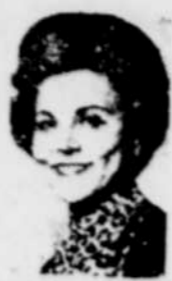
By Ann Landers