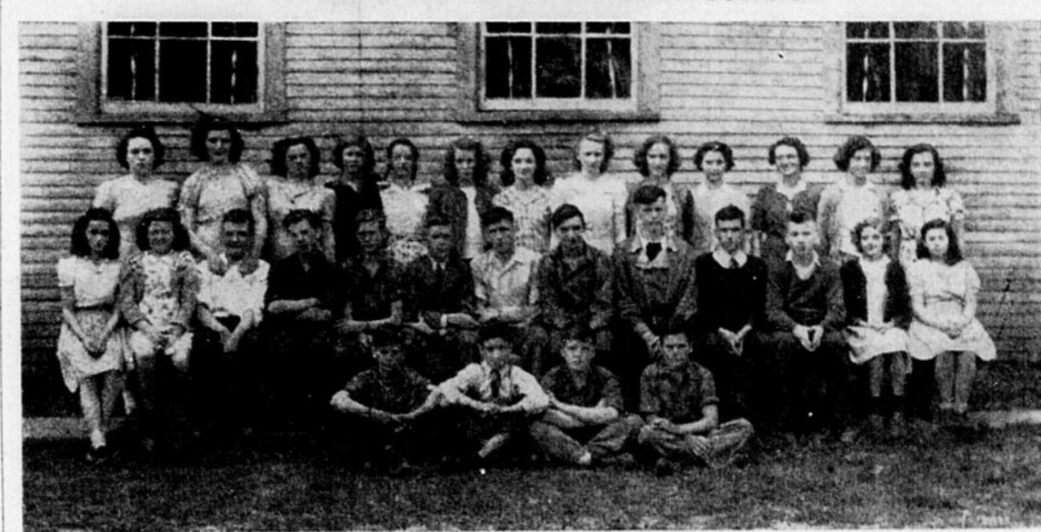
SCHOLARS OF GRADES 6-9