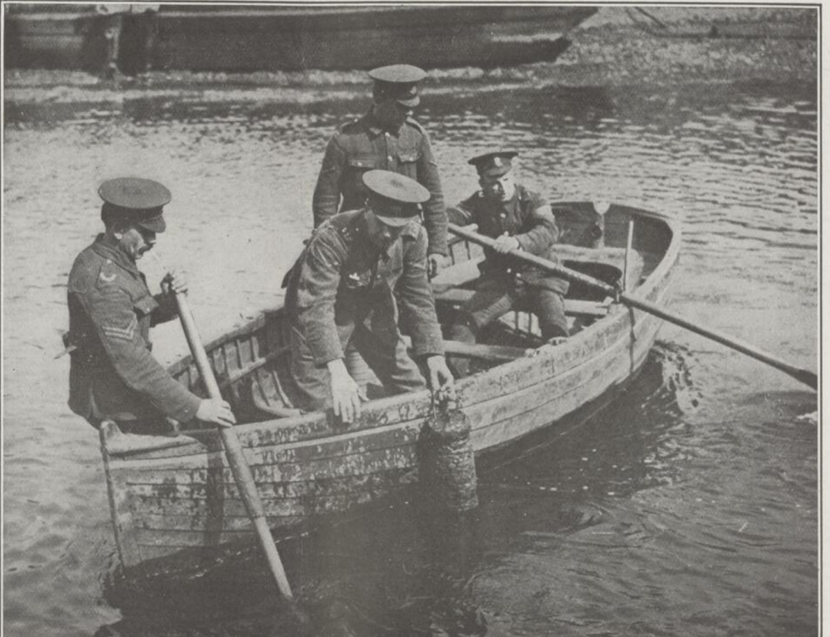
ONE OF THE WEAPONS OF THE BABY-KILLERS. —Soldiers recovering an incendiary bomb which fell into the river at Maldon, England, during a recent German air raid.