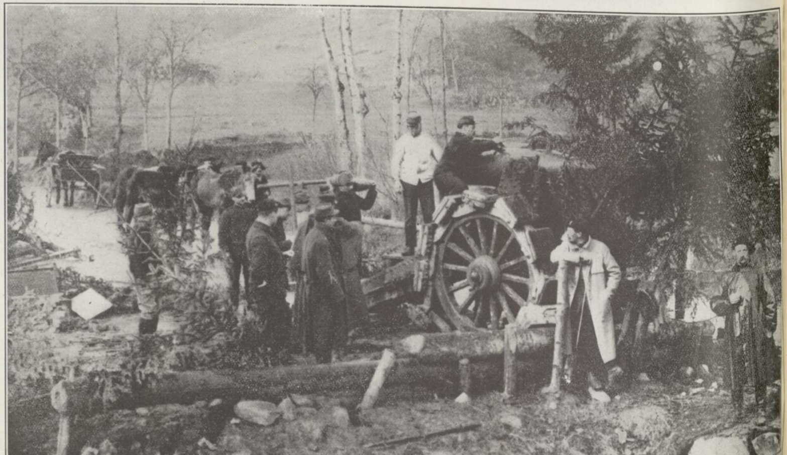
MAKING READY TO BOMBARD THE GERMAN TRENCHES.—A French heavy gun being placed in position "somewhere in France" under cover of fir-trees. Note the caterpillar wheels.