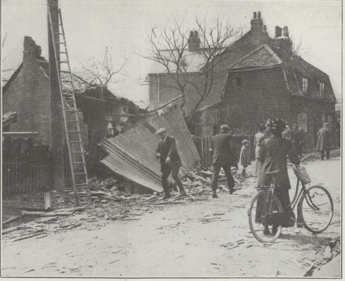
A GERMAN AIR-RAID AND ITS RESULTS. —This picture shows all the damage the Huns were able to effect at Maldon, England, during one of their recent air raids.