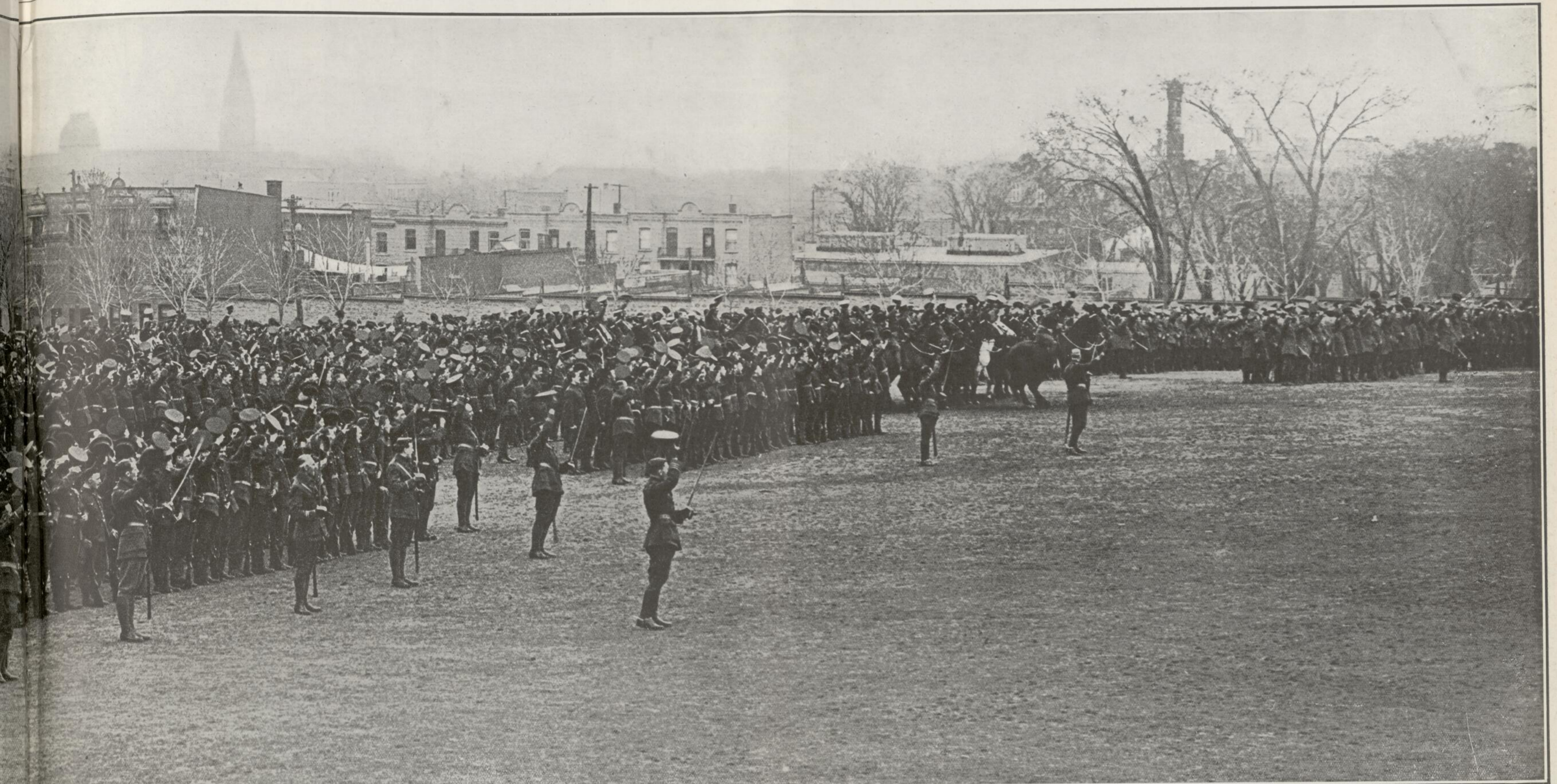
LE GOUVERNEUR GENERAL DU CANADA FAISANT L'INSPECTION "THE IRISH RANGERS" ET DE LA GARDE NATIONALE (HOME GUARD DE MONTREAL).—La photographie ci-dessus perpétue une scène émouvante à la Ferme Fletcher, à Montréal, qui suivit l'inspection de cette Garde et "The Irish Rangers" par S.A.R. le Duc de Connaught. Après que Son Altesse Royale eut passé parmi les rangs le duc retourna à la plate forme érigée pour le parti Vice-Royal et demanda aux troupes de crier trois hourrah pour le Roi. La photographie ci-dessus fait voir les principaux citoyens du pays, acclamant le commandant en chef des armées canadiennes, qui les passe en revue. Parmi ceux qui acclament le Gouverneur-General on voit plusieurs millionnaires qui ont répondu à l'appel aux armes. Parmi eux on verra des professeurs d'université, des grands financiers, des marchands importants, des employés de magasins, des artisans qui tous, dans un même élan de patriotisme ont répondu à l'appel de défendre leur pays, si l'ennemi nous attaquait.