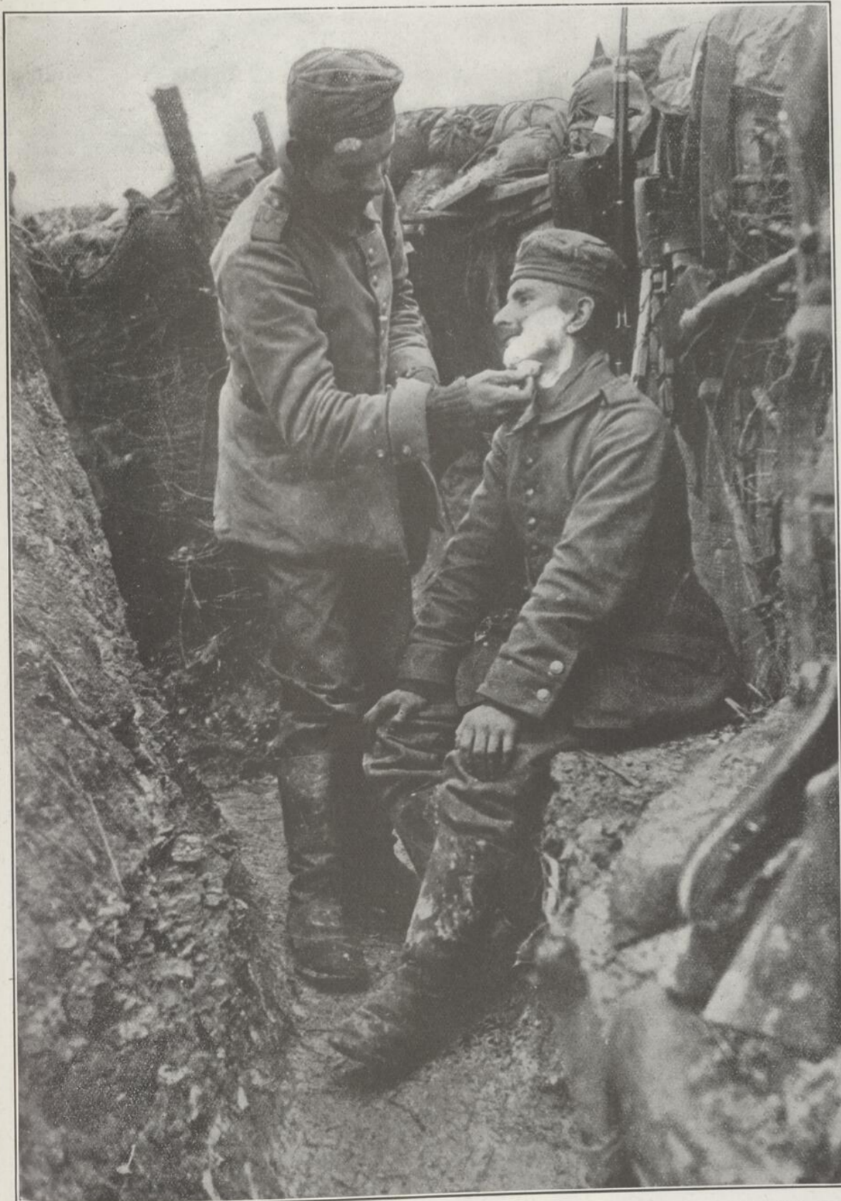
A DANGEROUS "CLEAN-UP" WHEN SHRAPNEL IS FLYING OVERHEAD.—German barbers at work in trenches situated only 70 metres away from those occupied by the Allied troops.

In the picture published on this page the Irish Rangers are the troops on the extreme left, next to them is the Mounted division of the Home Guard, and beyond the mounted troops are the other units in the Home Guard Battalion. More than 2,500 officers and men were on parade, the majority of whom are included in the above illustration.