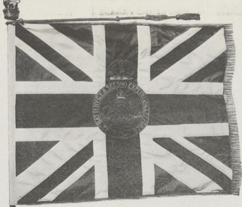
A FLAG THAT NOW HANGS IN BRITAIN'S GREAT VALHALLA.—The King's Color of the 22nd Battery, C.F.A. Expeditionary Force, which was recently deposited in Westminster Abbey, London, and which now hangs in Henry VII's Chapel.