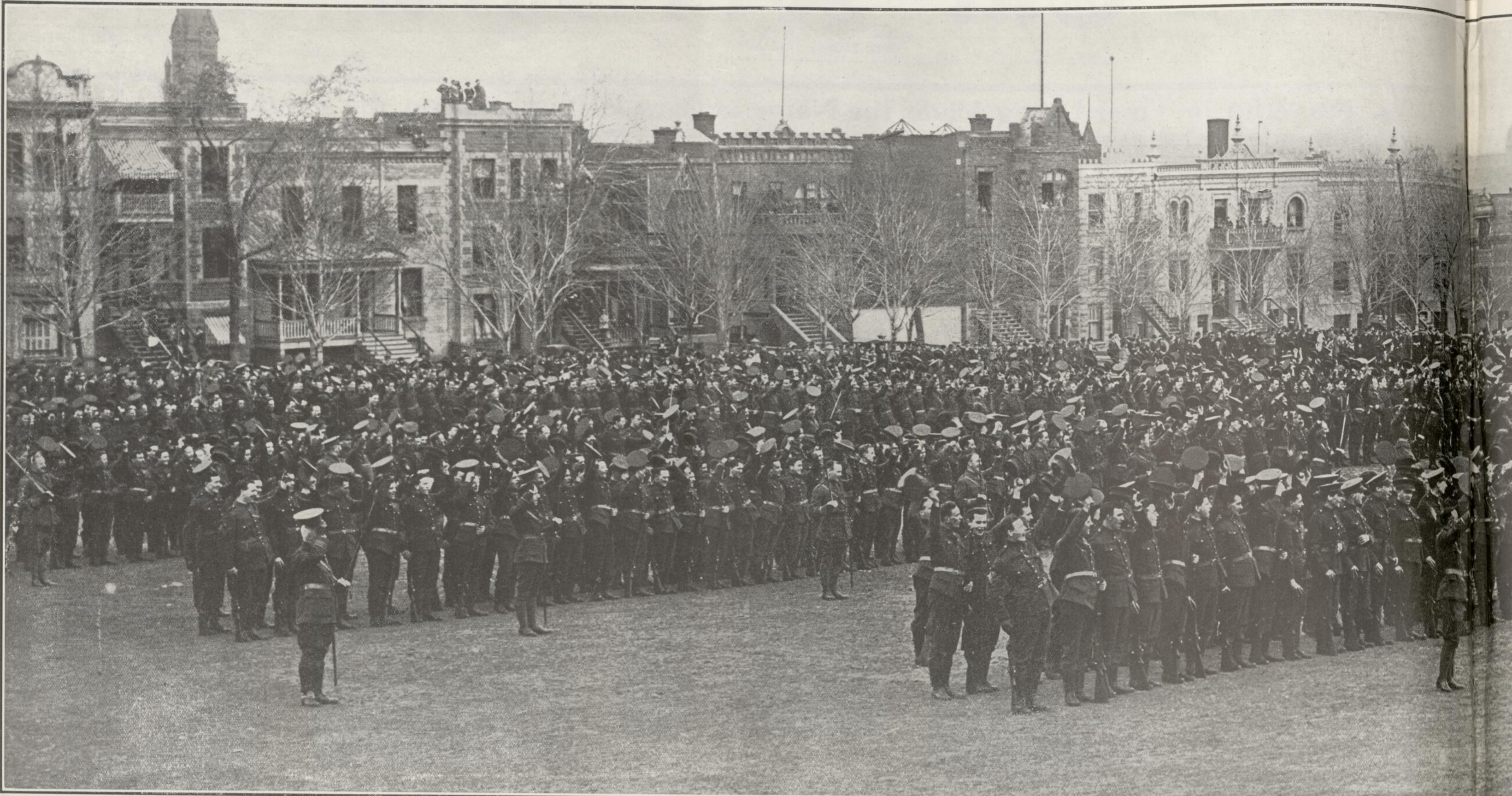
CANADA'S ROYAL GOVERNOR-GENERAL INSPECTS THE IRISH RANGERS AND HOME GUARD.—The above picture perpetuates the scene on Fletcher's Field, Montreal, that followed the inspection of these units by H.R.H. the Duke of Connaught. After His Royal Highness had passed through the lines of khaki-clad troops he returned to the saluting base and called for three cheers for the King. The above picture shows the magnificent response the men made to the call. In the ranks of the Home Guard are millionaires, University professors, merchant princes, financiers, professional men, railway officials, artisans, clerks, mechanics—all banded together to defend their city in case it should be attacked by the enemy. In the illustration the Irish Rangers are on the left and the Mounted and Infantry Companies of the Home Guard are on the right.