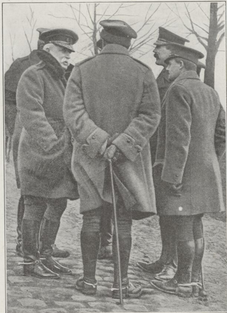
THE BRITISH COMMANDER-IN-CHIEF IN FRANCE.—A recent picture of Sir John French (on the left of the group) and some of his brother officers who are serving King and country so well at the front.