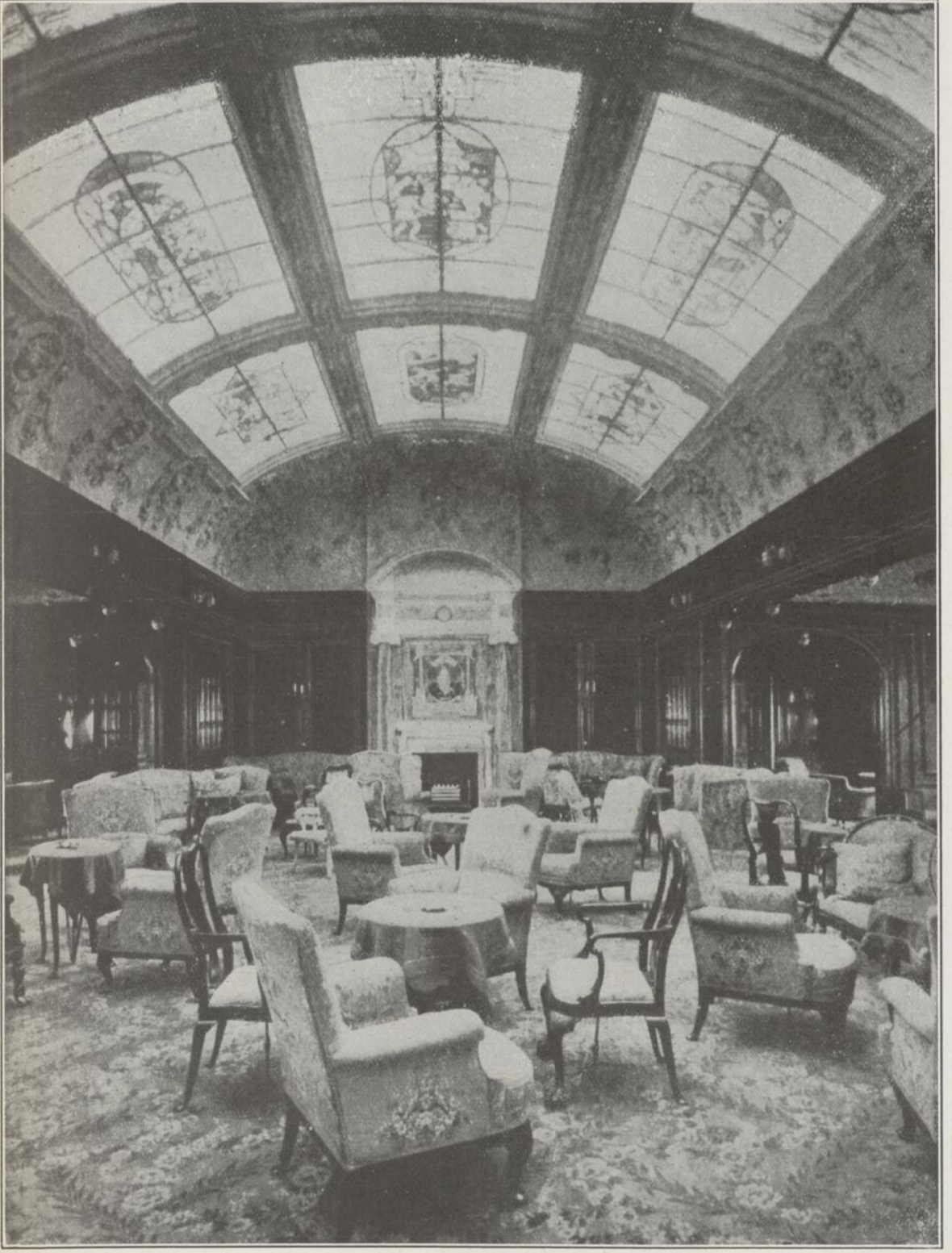
THE LOSS OF THE LUSITANIA. —A view of one of the lounges of the great Cunarder, which was one of the most luxurious steamers in the trans-Atlantic service.