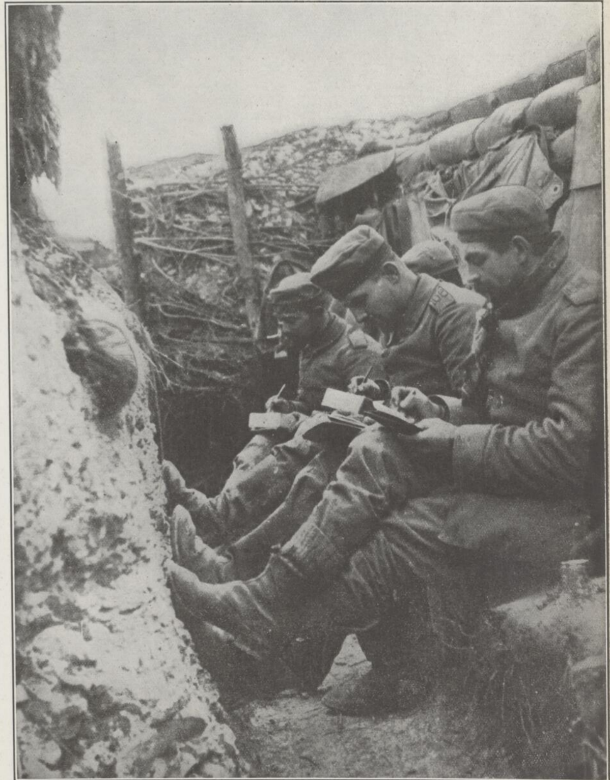
LETTER-WRITING DURING A LULL IN THE FIRING OF THE BIG GUNS.—A snap shot taken by one of The Standard's daring photographers right in the trenches of the enemy.