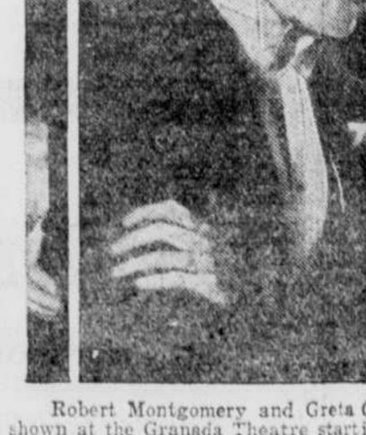
Robert Montgomery and Greta Garbo in "Inspiration", which will be shown at the Grand Opera Theatre starting tomorrow.

He proposed, said the Opposition leader, to devote some little time to discussion of the Imperial Economic Conference, but first he would refer briefly to other matters mentioned in the Speech. The Speech forecasted effective methods to aid agriculture, but the country was looking in vain for that.