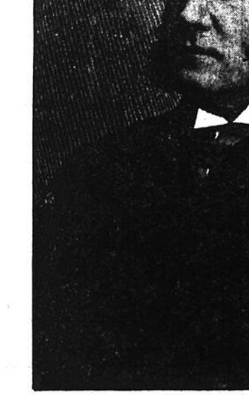
THE LATE HON. J. O. VILLENEUVE. (See also page seven.)

"I can say right here that I am not in favour of supplementary tenders. Why should they be called? The Fire Committee, after months of work, prepared specifications and asked tenders upon them for the electric lighting of the city."