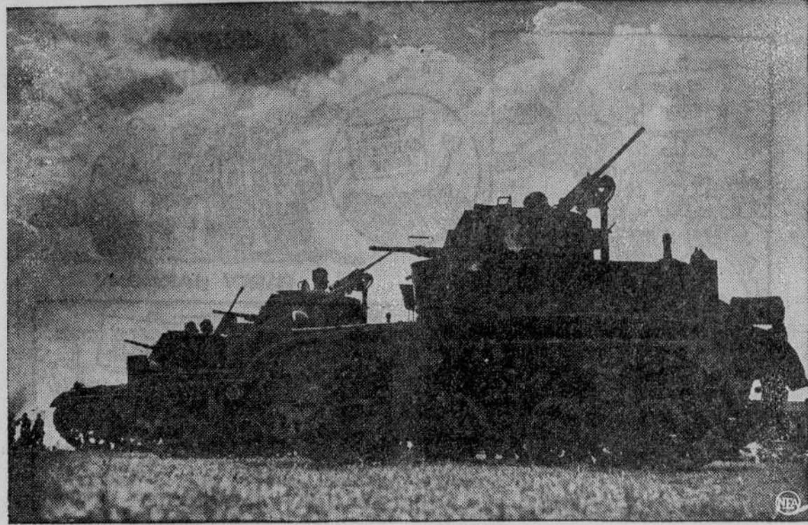
Talk about bristling with armament, it certainly applied to the big "combat cars" developed by the U. S. Army Tank Corps for heavy combat duty and demonstrated at Governors Island, N.Y. With machine guns fore and aft, it is hard to tell whether they are going or coming. They can hurl death at the enemy from three 30 calibre and one 50 calibre machine guns as well as a Thompson sub-machine gun and the four automatic pistols of its crew.