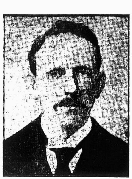
The New Marquis of Salisbury, Formerly Viscount Cranborne.

They have here the same liberty without the license which prevails there. (Hear, hear.) Some fear has been expressed as to the influence which will be exerted in the future by the large body of American citizens who have crossed the border and settled in this country. You need have no fear on that score. (Applause.) It is seventy years since I presided at a meeting which invited American colonists