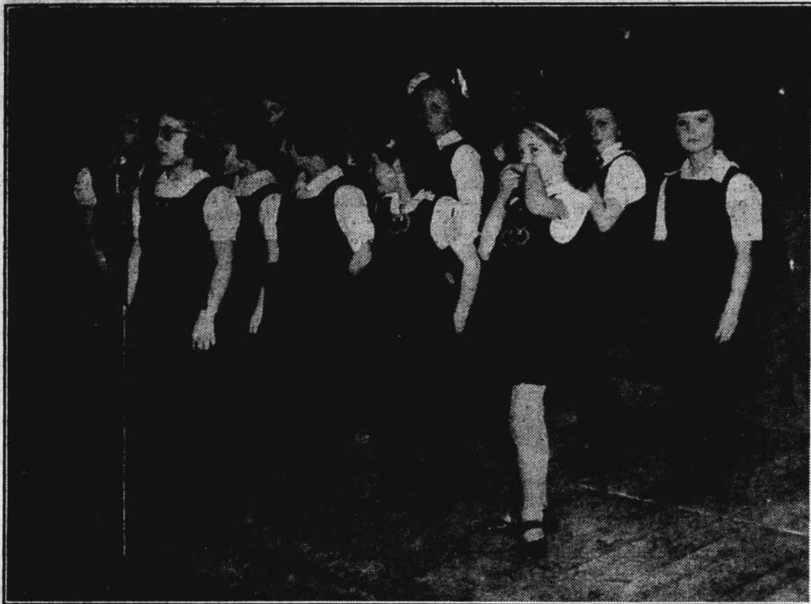
KING'S SCHOOL CHRISTMAS PROGRAM