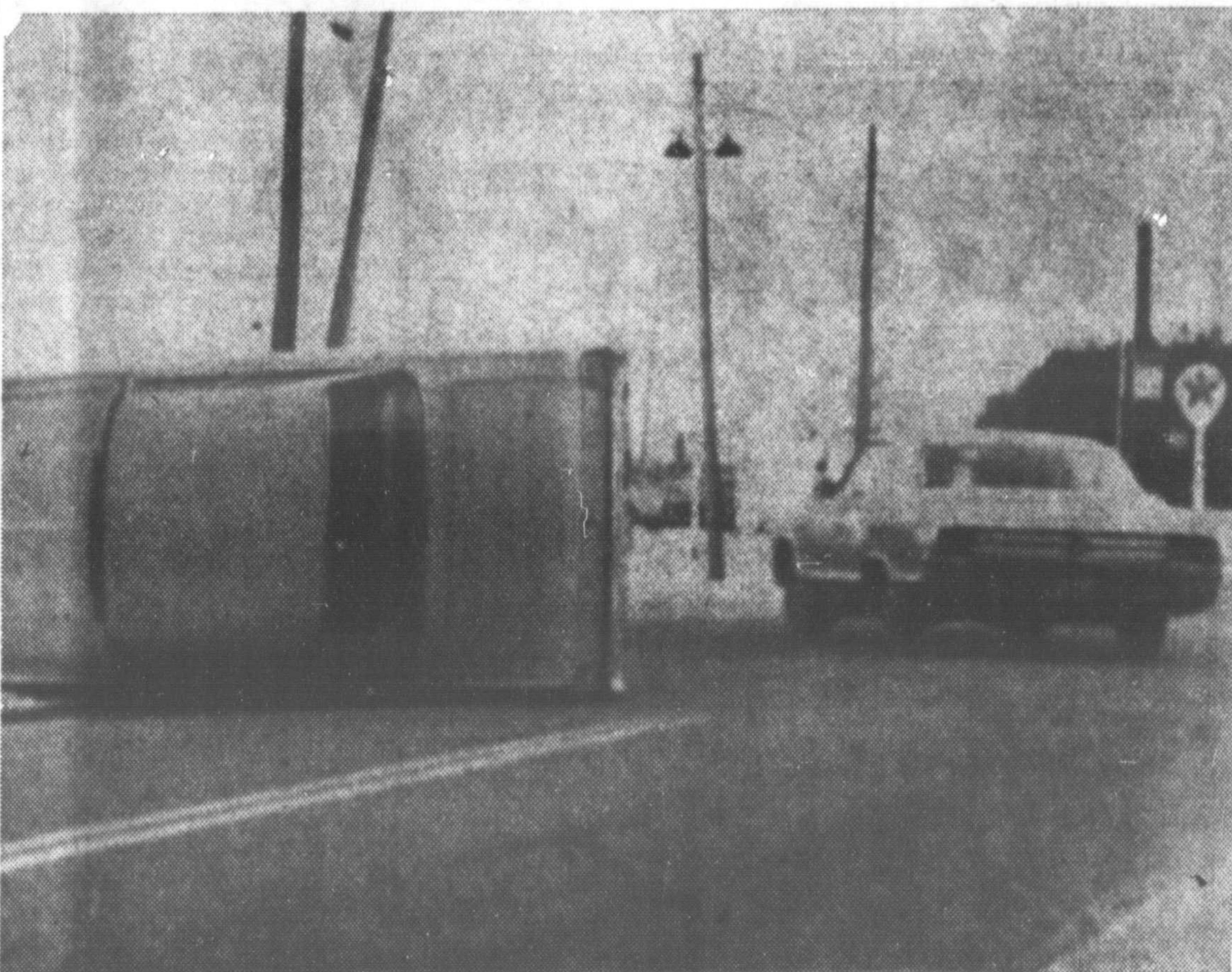
Auto Acrobatics on Highway 8 (no fatalities this time)

Clarendon: Seat 2, Freeman Grant; Seat 5, Marshall Chamberlain; Seat 6, Ervine Brownlee.