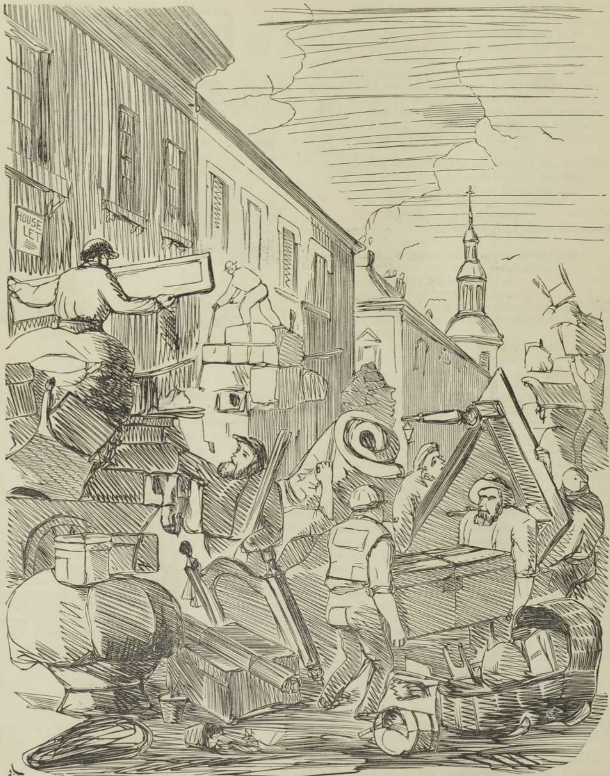
FIRST OF MAY IN CANADA.