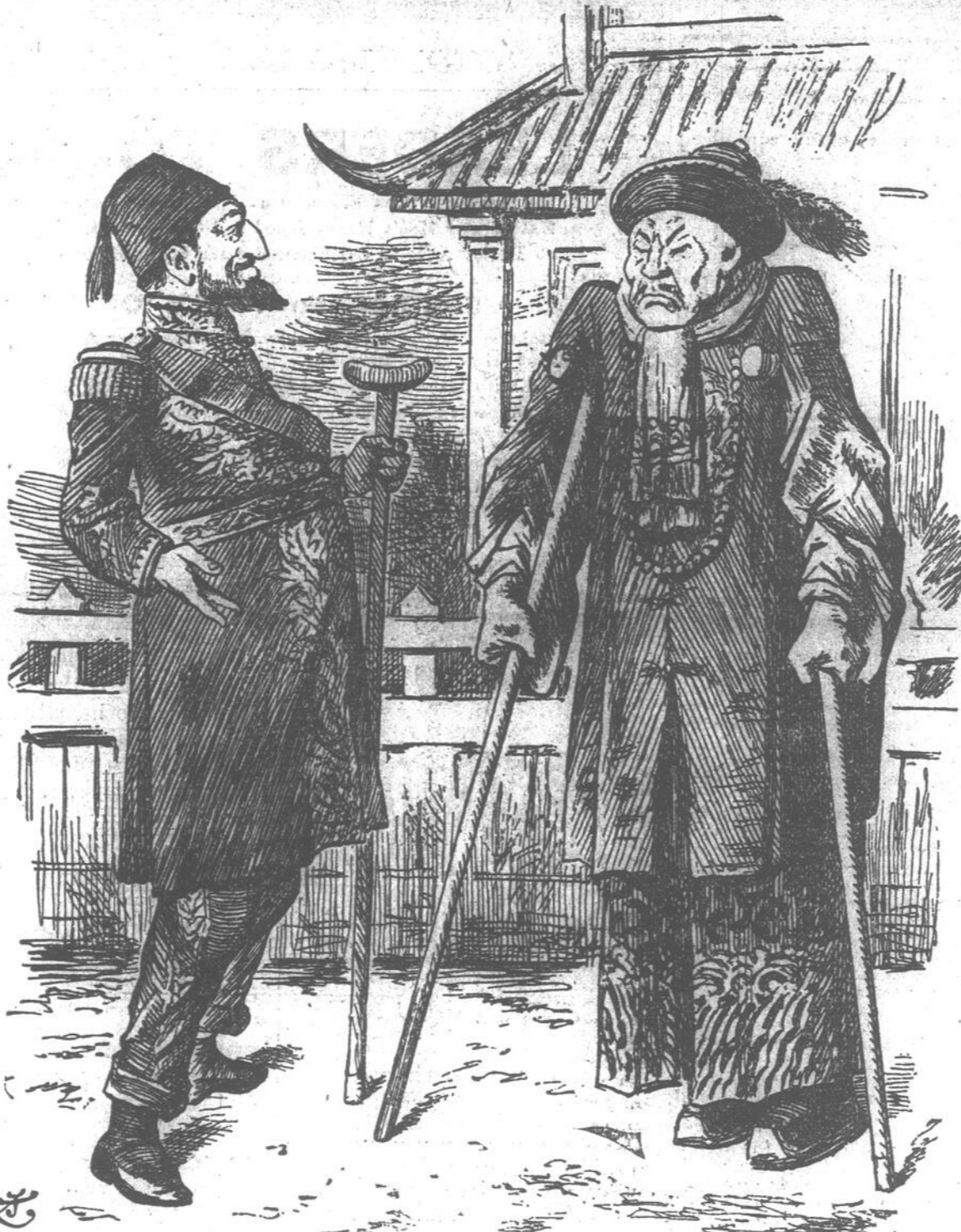
ANOTHER "SICK MAN."

Although there were several offers much better than the Street Railway's offer, the aldermen decided to give it the street railway contract, although it